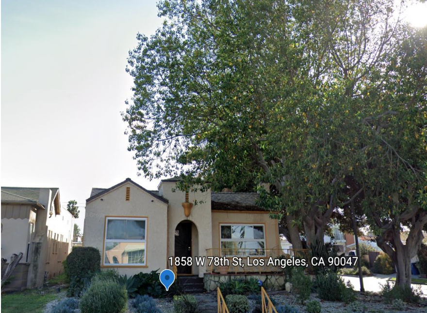
1858 W 78th St, Los Angeles, CA 90047

1971 W 190 th Street, Suite 200 Torrance, CA 90504 Mark Granger DRE # 00848783 310-323-1550 x 26 mgranger@grangerco.com